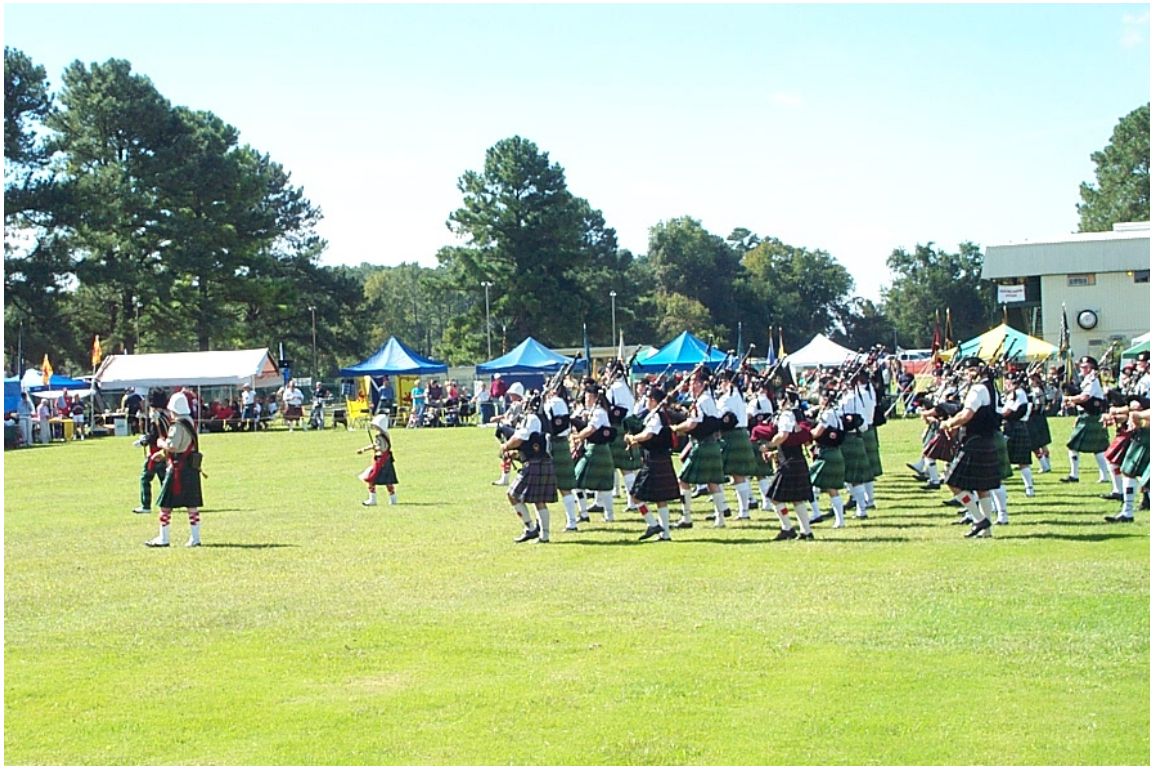
The Massed pipe bands