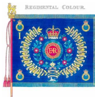
Royal Scots colours, above; in Basra, Iraq, below