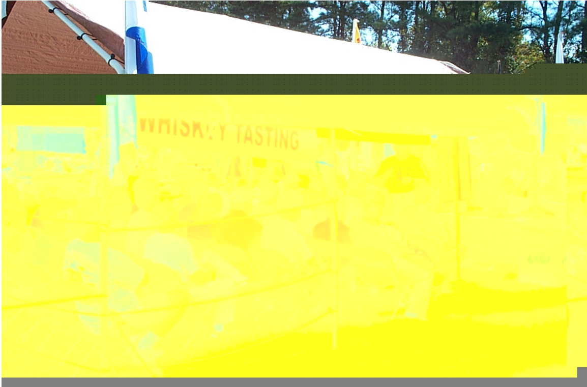
First stop - whiskey tasting Second stop – Saint Andrew's Society tent