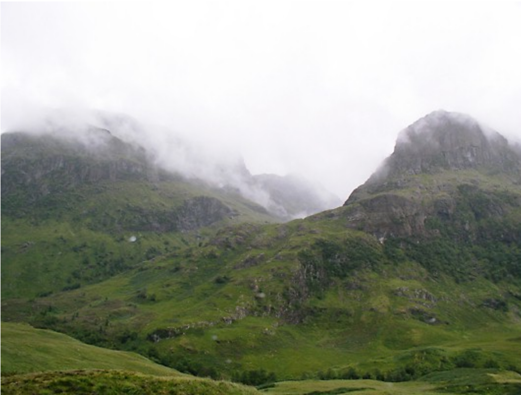
Glencoe.