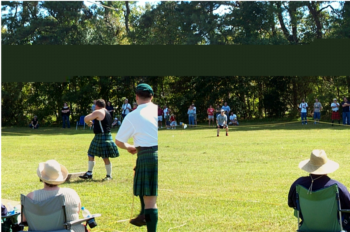
Hammer tossing (hammer can be seen in the air top left)