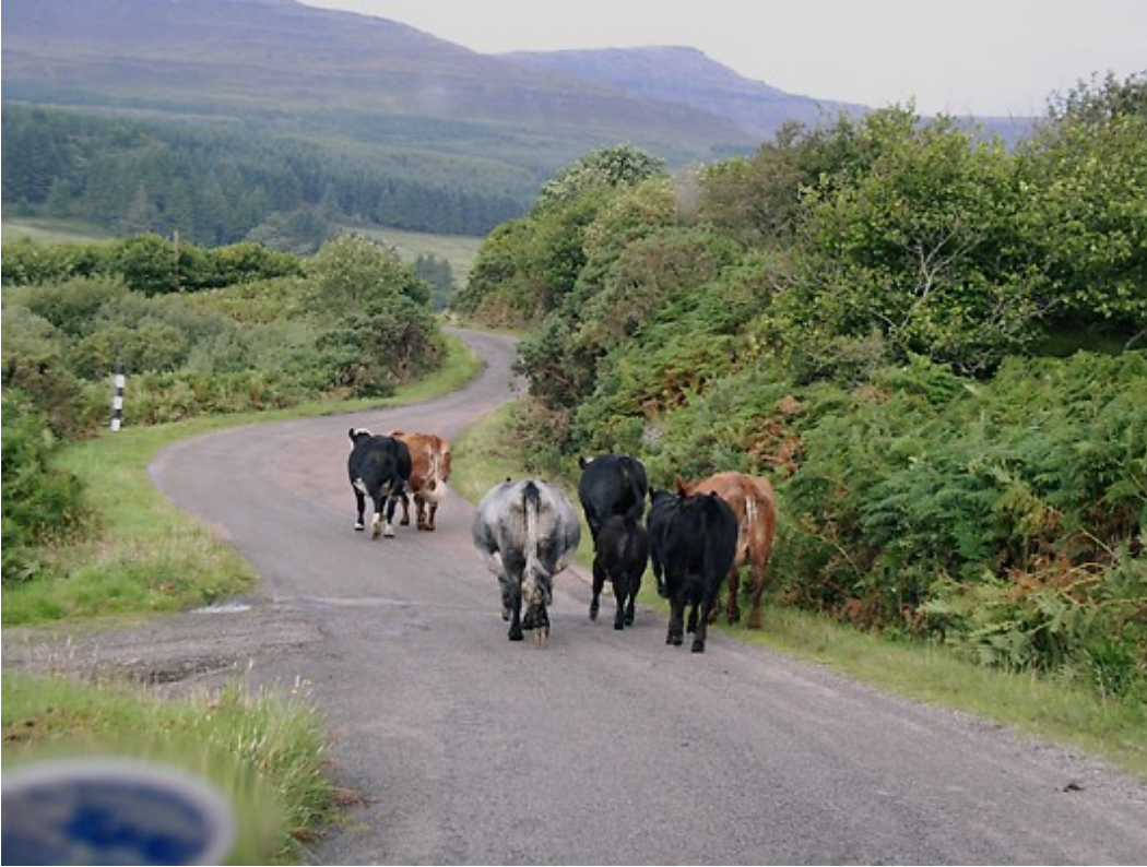
Traffic jam on Skye.